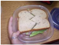
Whose sandwich is this anyway?